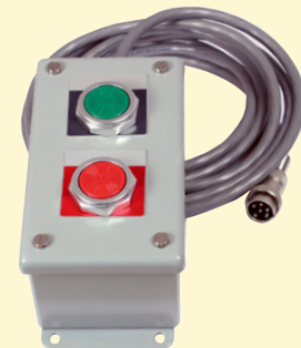
Remote Start/Stop Part #A3258

Uses shop air pressure to anchor to non-ferrous surfaces such as stainless steel, aircraft aluminum or even plexiglass.