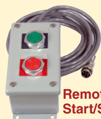
Remote Start/Stop Part # A3258