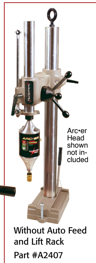
Arc'er Head shown not included