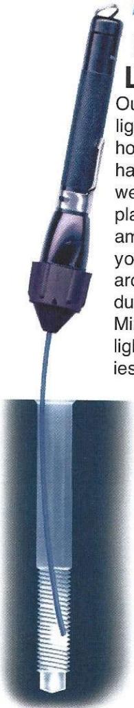
Inspection Light Kit Part # A5053

Our powerful new fiber-optic light is ideal for inspecting holes in work-pieces that have had a broken tool removed as well as other hard-to-reach places. The 7-inch 3/32" diameter probe doesn't obstruct your view and will snake around corners. Best of all, it is durable. The aluminum-cased Mini-Mag Lite provides brilliant light. Powered by 2 AA batteries (included).